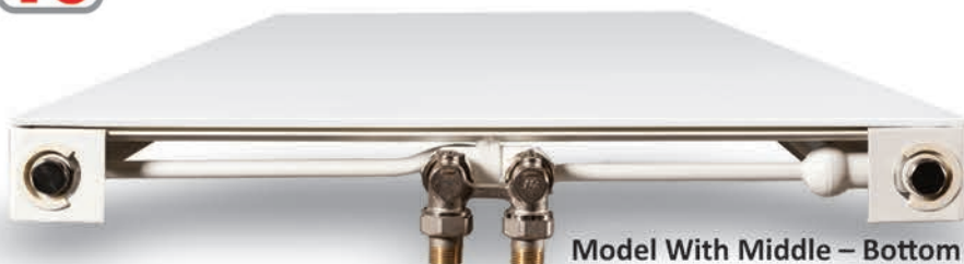
Model With Middle – Bottom Connection